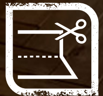
CUT & FOLD