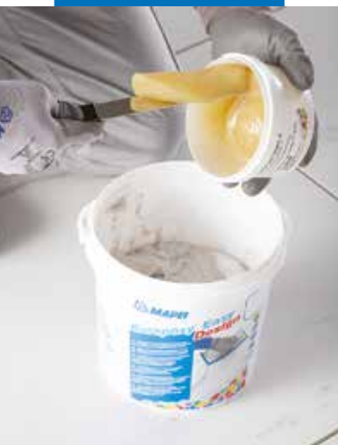
Pour the hardener (component B) in the container of component A