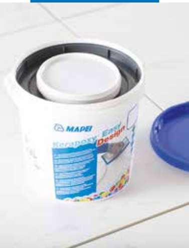
Two-component grout supplied in drums containing both component A and component B