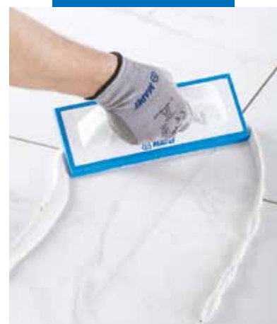
Easy-to-apply epoxy grout