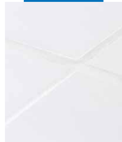
Floor grouted with Kerapoxy Easy Design