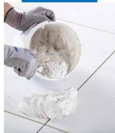
Obtain a creamy homogeneous mix

4 days. After 10 days, the surfaces may also