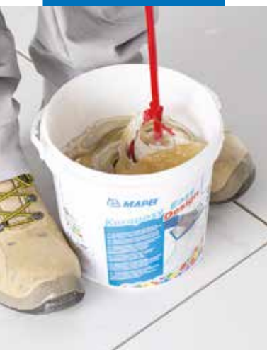
Mix the components (A+B)

workability of the grout/mortar is not affected. When applied correctly, Kerapoxy Easy Design produces joints with the following characteristics: