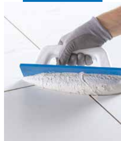
Spread Kerapoxy Easy Design with Mapei trowel