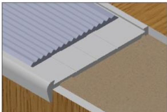
MJ150 with MJ152 insert