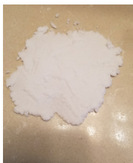
Place approximately ¼” thick poultice over stain