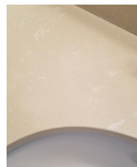
Remove after 24 hours, repeat process for harder stains