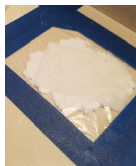
Place damp paper towel, cover & tape air tight