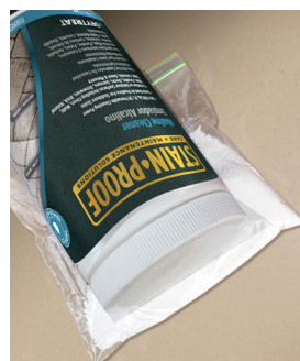
Crush Alkaline Cleaner into a fine powder

1. Place Alkaline Cleaner powder into a plastic bag and crush it into a fine powder by rolling the product container repeatedly over it. 2. Mix powder with water or other liquid to make a paste (on average, 1 scoop of powder mixed with ½ scoop of clean water or other liquid will yield 1 scoop of poultice). Mix should be dry but moist enough to create a paste (the consistency of peanut butter). 3. Place approximately ¼” thick poultice over stain, extending it ½” past the visible stain. 4. Place a damp paper towel on top of poultice, then cover both with a plastic bag, fixing all sides with painter’s tape until airtight. 5. Remove after 24 hours. 6. Repeat if necessary. Many stains will come out on the first try, but some stains will require 2-3 poultices.